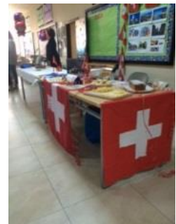
Swiss booth at the BIS

Fern ab der Heimat legt man plötzlich wieder mehr Wert auf nationale Sitten und Gebräuche. So kam es dann, dass ich in der amerikanischen Schule in Baku unsere Heimat, die Schweiz am International Day repräsentieren konnte. Mit Stolz haben wir Käse, Schokolade, selbstgebackenen "Rüebli-Kuchen" und Birchermüesli zum Verzehr angeboten, die Nachfrage war entsprechend gross und bald war alles aufgegessen. Meine Tochter und ich haben in alten Nationaltrachten heftig serviert und über die Schweiz philosophiert. Das Interesse war gross und zeigt einmal mehr, dass der Nymbus Schweiz im Ausland immer noch auf reges Interesse und Bewunderung stösst. Deshalb würde es uns Schweizern oft gut stehen, uns im internationalen Kontext etwas selbstbewusster zu geben, traditionelle Schweizer