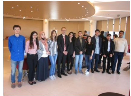
Students of ADA after the presentation