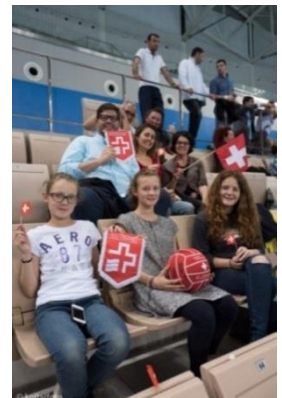
Swiss colony in Baku supporting the Swiss team

A small Swiss fan group also gathered for the matches of the Swiss national U19 water polo team which competed in the European Championship Qualification-Tournament in Baku in May. Thanks to our visibility we were approached before the game by the group leader of the Swiss team and parents. This gave us the opportunity to learn more about the rules of the game. The Swiss Team was impressed by the world-class swimming center in Baku which was built last year for the European Games. Back home they only dream of such facilities.